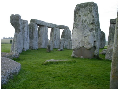
Stonehenge, Inner Circle - June 16, 2007.

In this picture, it looks like there may be someone standing against a stone towards the back of the picture. However, this is not a person. It is a figure in the stone. The large stone which dominates the picture seems to have one or two faces in the surface of the rock.