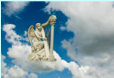
“Angel in the clouds”