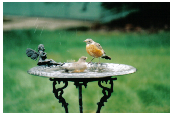
Robins and spring

To everyone who could not attend and to those who have inquired about our celebrations, we are planning to have the summer and winter solstice events, and the autumnal equinox gathering. We will be posting the dates on the web site for all who wish to attend. Even though the day has passed, we suggest that you write out what you wish to give up and what you wish to get, and list out those people that you wish to give blessings to because you are grateful for your own life. After completing this, you too will have celebrated the Equinox.